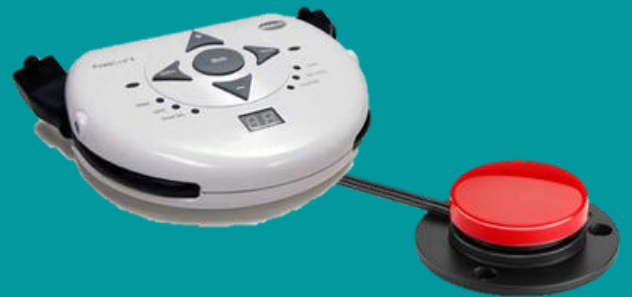
PowerLink & Switch