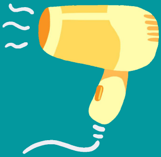
Hair Dryer or Fan

COMBINE THE POWER OF A POWERLINK WITH A HAIR DRYER TO CREATE MUSIC!